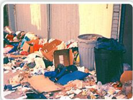
Problem area after...