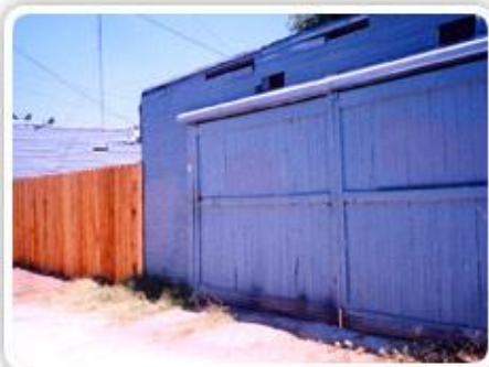
Project 365 really does work!