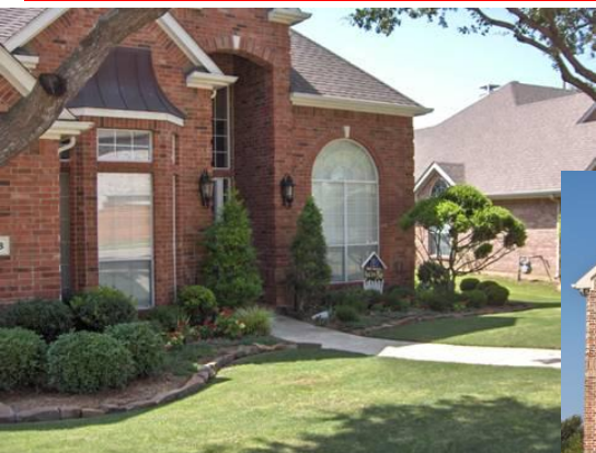
4013 Heron Cove