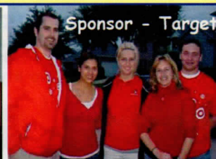
Sponsor - Target