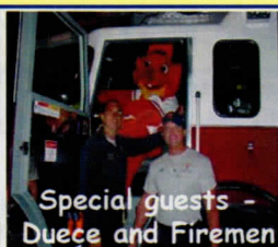
Special guests - Duece and Firemen